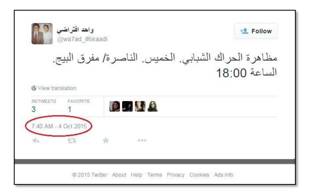
Figure 2. Tweet preceding the scheduled demonstration in Nazareth, sent on Sunday, October 4, in the morning: "Demonstration of al-Hirak a-Shababi. Thursday. Nazareth / BIG [mall] junction. 6 PM"

their support for al-Aqsa.<sup>32</sup> al-Hirak a-Shababi (the Youth Movement) launched its own efforts to organize a popular demonstration in Nazareth that would express people's rage and protest against the situation in the al-Aqsa mosque.<sup>33</sup> This loosely structured organization draws its power from the social network activities of young Arabs, and its name has been cited in the media in recent years in the context of Arab Spring events. Organizations with similar names have also sprung up in neighboring Arab countries.